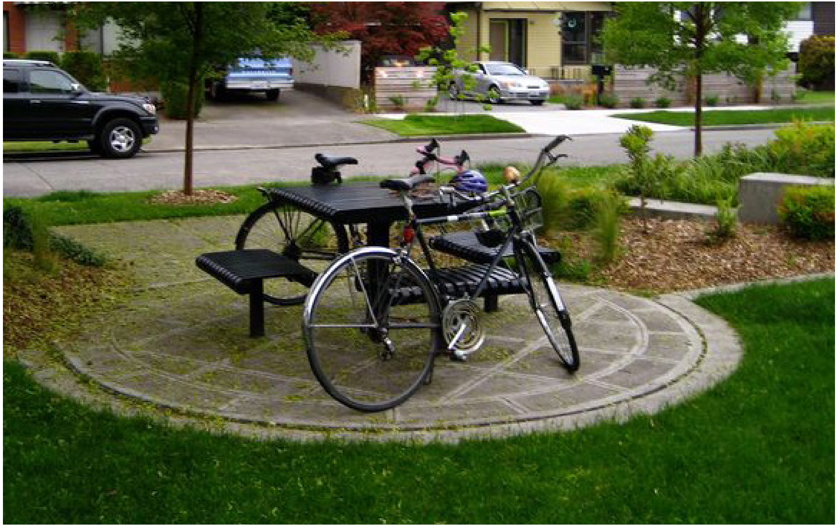
CONCEPT IMAGE: DESIGNATED PICNIC SPACE