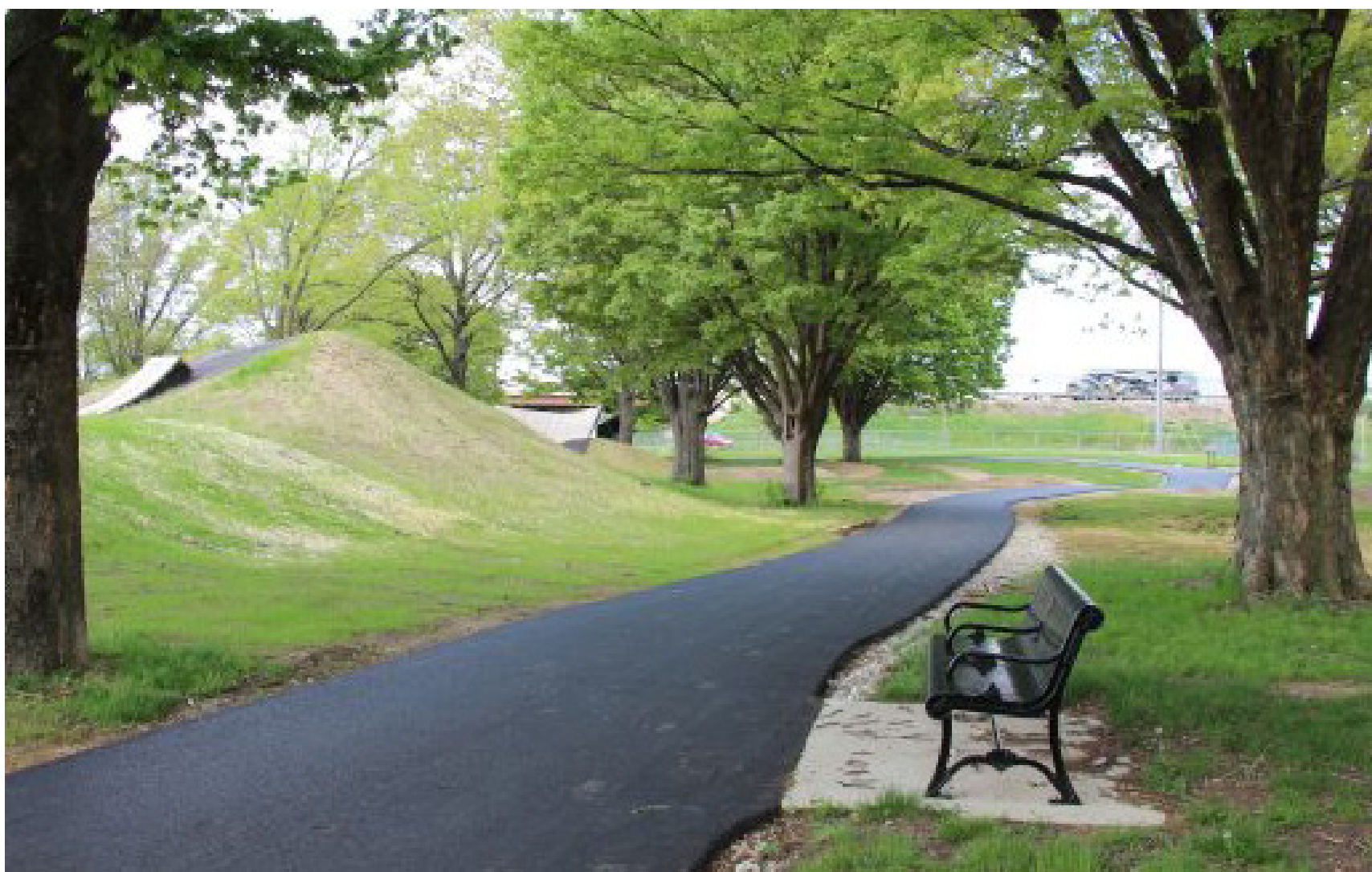
CONCEPT IMAGE: NEW ASPHALT PATH + CONCRETE BENCH PAD