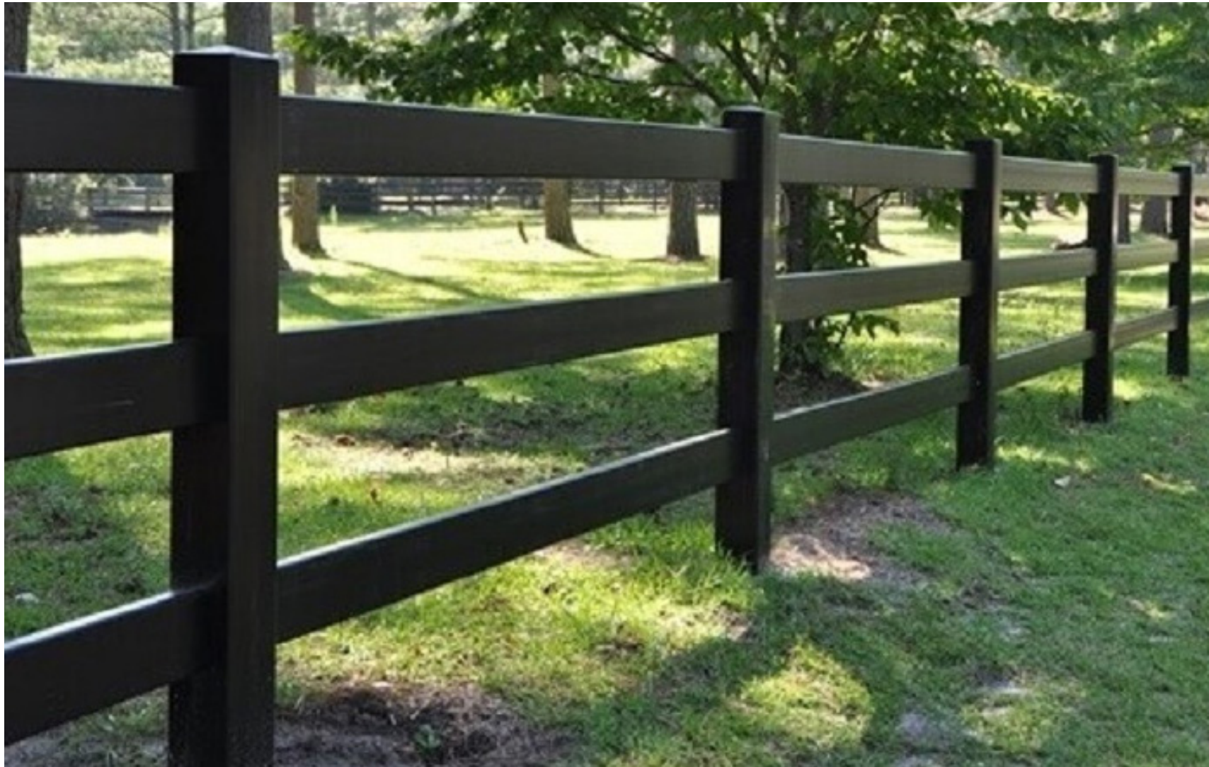
CONCEPT IMAGE: THREE RAIL FENCE