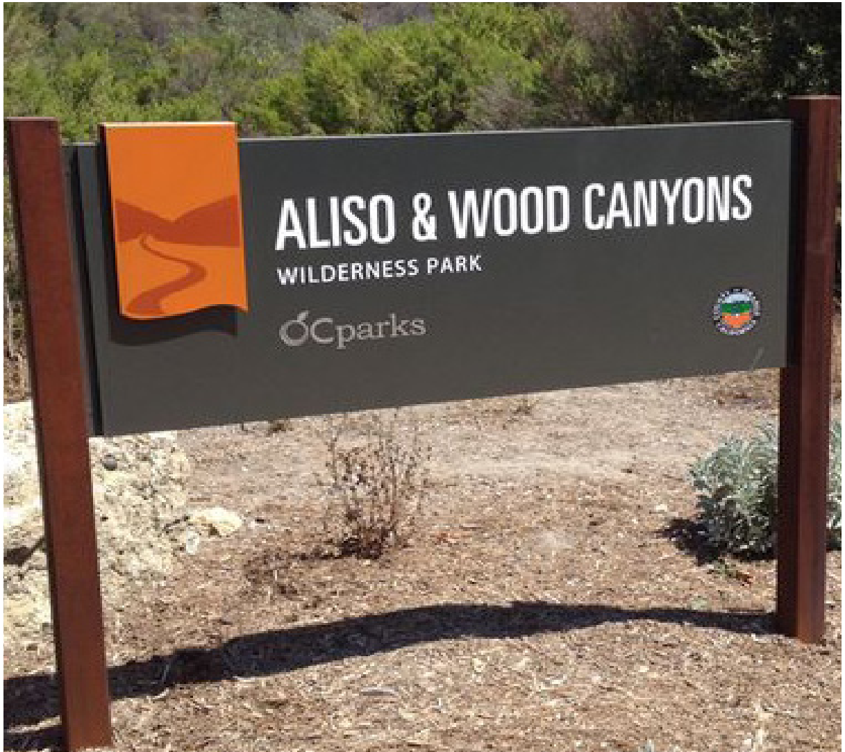
CONCEPT IMAGE: ENTRANCE SIGNS