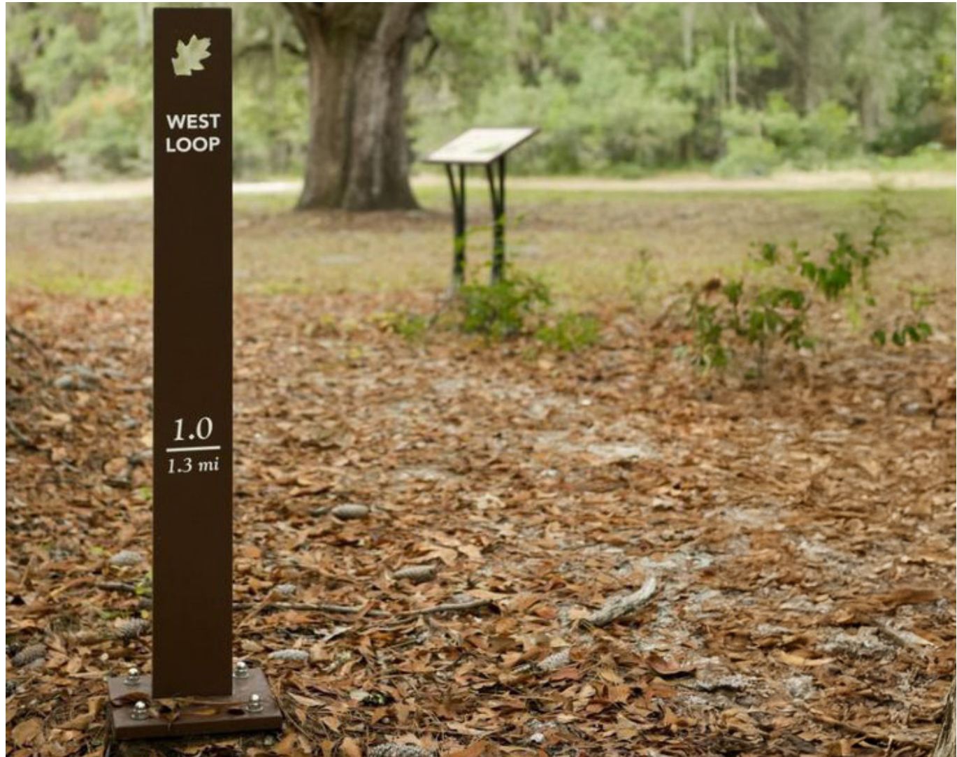
CONCEPT IMAGE: SIGNAGE