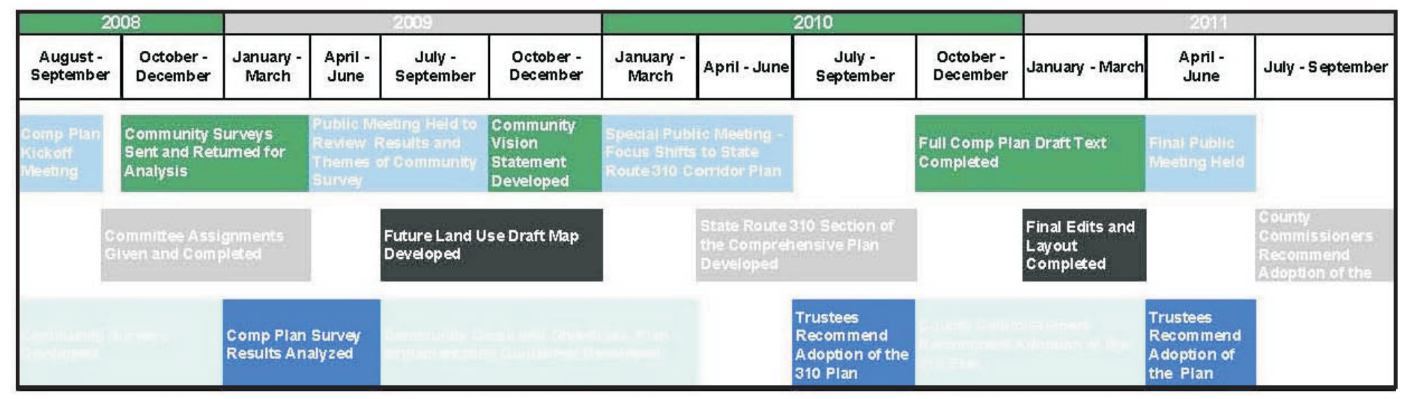
Figure 2: Project timeline.

In early 2010, the focus of the plan shifted to the State Route 310 corridor section of the community. A group of community members wanted to revisit a SR 310 corridor plan that was developed by the