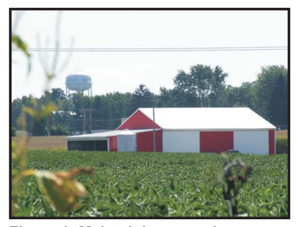
Figure 1: Maintaining a rural atmosphere is very important to Etna Township residents.

Within the body of this document, goals and strategies to achieve them have been developed. The information in this document will provide direction for township officials to follow to achieve those goals. Additionally, a future land use plan has been developed that