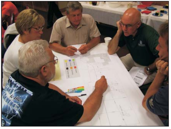
Figure 3: Township residents discuss the future land use map at a public meeting.

Columbus-based MSI planning and design firm. Their support for that plan prompted several community meetings about the SR 310 corridor. At the request of the trustees, the planning committee reviewed this document and compared it with the work that had been done so far regarding that section of the township. Based upon that review and numerous planning committee meetings, a SR 310 Corridor Focus Area Plan was developed and approved by the township trustees. It was later adopted by the Licking County Board of Commissioners in late summer 2010.